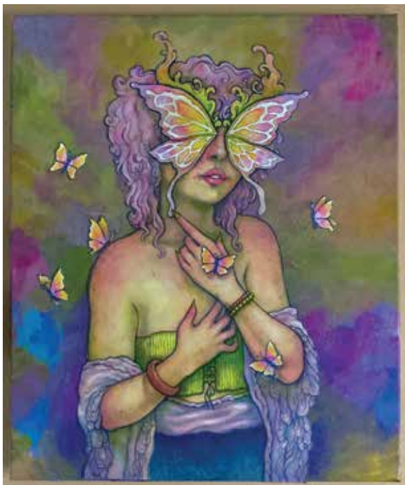
"Metamorphosis" by Charlie Myers

Hours: Wednesday - Friday, 12:00 PM - 5:00 PM Saturday - Sunday, 12:00 PM - 4:00 PM Closed Monday - Tuesday (All times in Eastern)